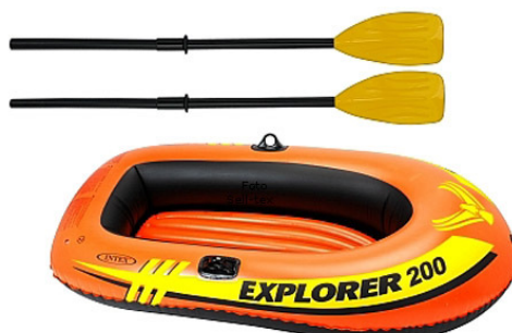
Leisure rubber boat