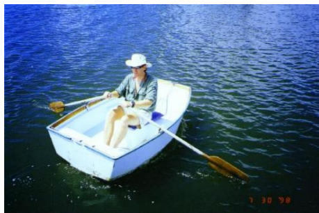
„Nutshells“ - Rowing boats under 2.50m

Due to security-reasons, the following boats will not be allowed :