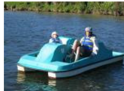
Pedalos and Surfboards