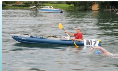
on the lake

Due to security-reasons, the following boats will not be allowed :