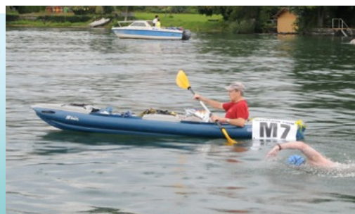
on the lake

Due to security-reasons, the following boats will not be allowed :