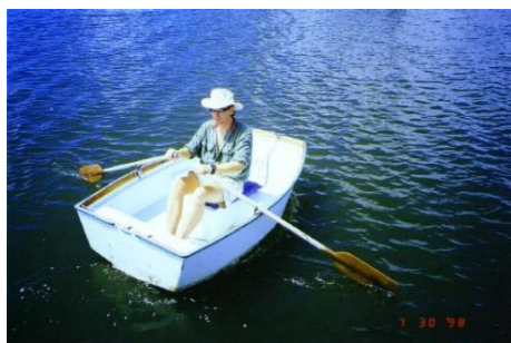
„Nutshells“ - Rowing boats under 2.50m

Due to security-reasons, the following boats will not be allowed :