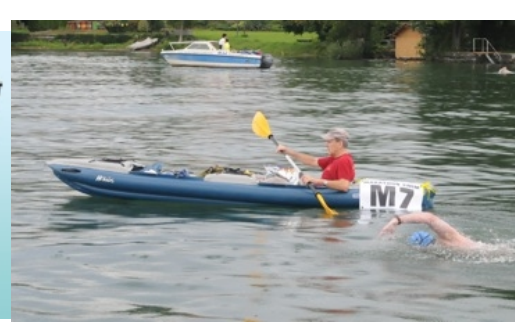
packed pumped up on the lake