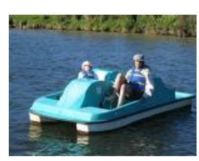
Pedalos and Surfboards