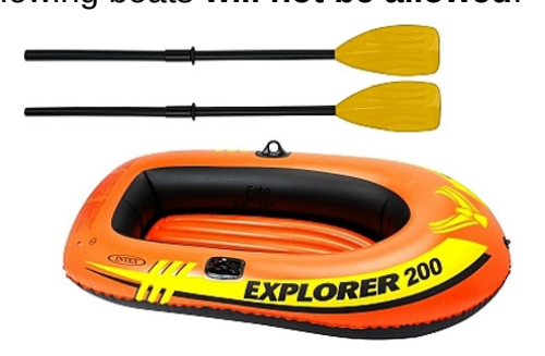
Leisure rubber boat